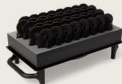
SpaceCraft Display Holders