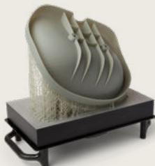
Radio Flyer, Seat Prototype