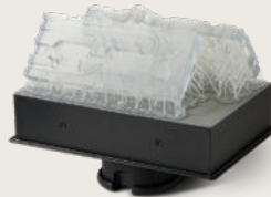
RightHand Robotics, Robotic Finger Overmolds