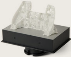
Battle Beaver Customs, Game Controller